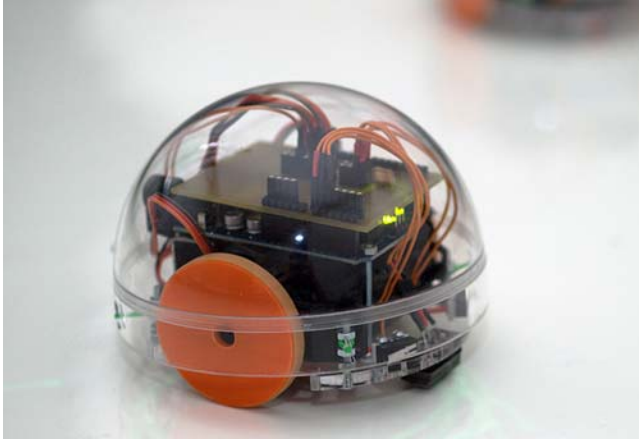
Fig. 2. A LumiBot. The transparent shell shows its technology.

Each robot is equipped with a UV LED on the bottom. The ultraviolet light activates the phosphorescent sheet so that the robots can leave glowing traces. The only sensors used are photo resistors. They enable the robot to find and follow glowing traces.